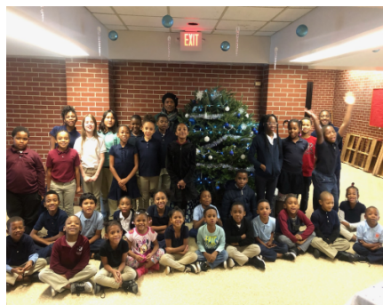
Neo Networks sponsored Holiday Celebration December, 2018

(a) Provided school supplies on an as needed basis.