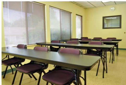
Picture of our tutoring center

The year 2018 was another successful year for Neo Networks, Inc.