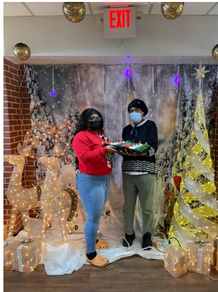
End of Year Celebration