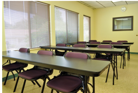
Picture of our tutoring center

Hello and greetings to all our donors and volunteers. I want to personally thank all of you for your dedicated support and hard work.