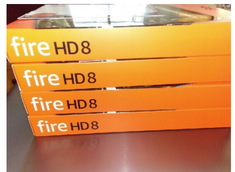
Amazon Kindle Tablet Giveaway

Hamilton Recreation Center After School Program: Neo Networks donated treats for the kids and teachers during the End of Year Holiday Celebration.