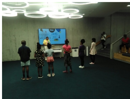
Children Participating in the Spelling Bee