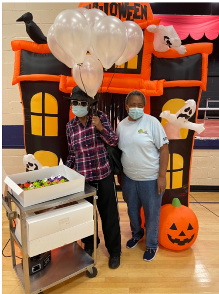
October Fun at the Center.

Below are some of the events that Neo Networks was able to interact with students and staff.